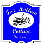
Solid Color Background