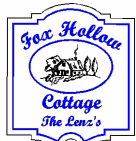
Color Border White Background